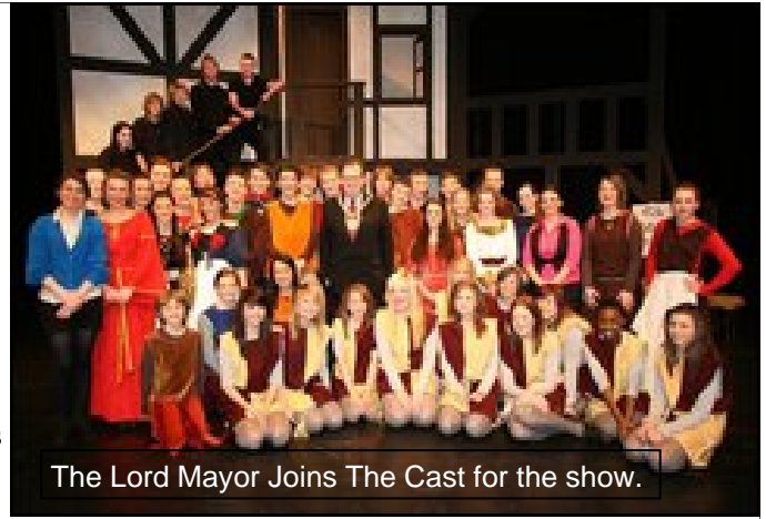
The Lord Mayor Joins The Cast for the show.

When all was said and done, however (and this will sound so very High School Musical-ish), the most important aspect of 'The Canterbury Tales', for us, at least, was the plethora of friends we made, amongst the cast, the staff, the dancers, and the band, (And, truly, living practically on top of each other during production week in the diminutive Waterfront dressing rooms is a serious test of character!) The cast will verify that all the hard work was worth it, and the audiences (12B included) will (hopefully) confirm that the result was highly entertaining.