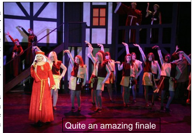
Quite an amazing finale